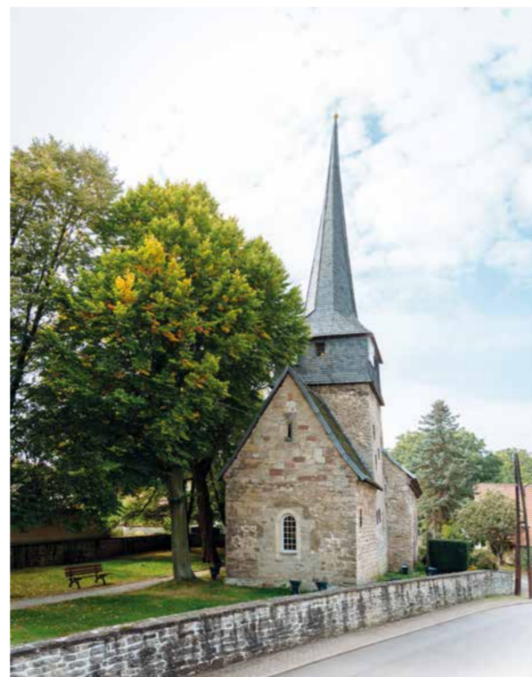
FEININGER CHURCH, GELMERODA

Beginning: Main building of the Bauhaus-Universität Weimar, Geschwister-Scholl-Strasse 8