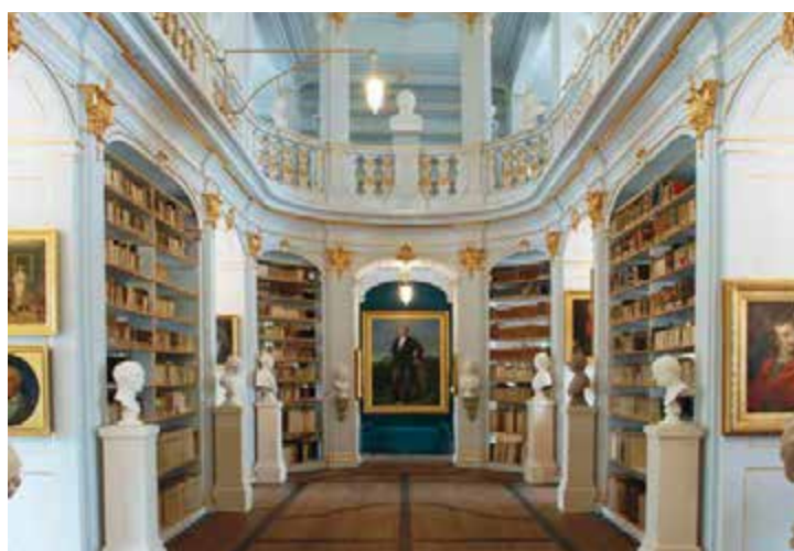
HISTORICAL HERZOGIN ANNA AMALIA BIBLIOTHEK, ROCOCO HALL