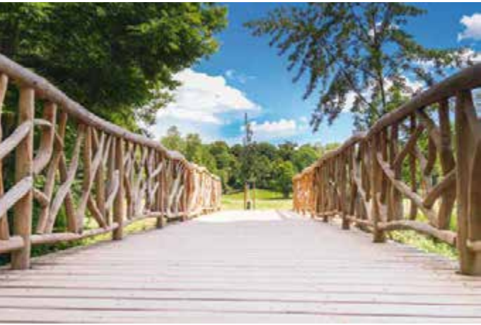
PARK ON THE RIVER ILM

Weimar's Onion Market is legendary. But Weimar shows how to celebrate throughout the year: the Pottery Market on the first weekend in September, the Wine Festival for Goethe's birthday surrounding August 28th, the Flower Market in May and the Easter Market in the spring. And: Nothing goes without onions! That is the motto on the second weekend in October for three whole days: On the tarts, in the frying pan, decoratively braided and in arrangements – the onion is celebrated in many ways at Thuringia's largest folk festival. During Advent, the historic centre is transformed into an illuminated Christmas Market that extends from the stands and mulled wine huts surrounding the famous monument of Goethe and Schiller on Theatre Square all the way to the historic Market Square. The renowned German Christmas carol "O du fröhliche ..." can be heard especially often in Weimar during Advent, because the text was written here.