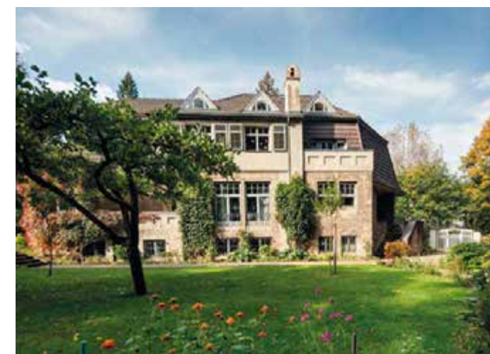
HAUS HOHE PAPPEN