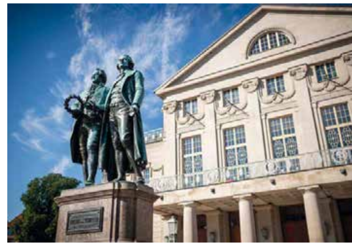
GERMAN NATIONAL THEATRE WEIMAR

From lighter entertainment to the greatest works of art – everyone finds what they are looking for in Weimar. The German National Theatre Weimar is among the most important and internationally renowned theatres in Germany. The Staatskapelle Weimar is a top-notch orchestra that is also much appreciated beyond Thuringia's borders. During the Thuringian Bach Weeks, the largest festival for baroque music in the world takes to the stage in Weimar. The Weimar Summer is full of highlights: Theatre in small and large venues, concerts in festive halls and outdoors, the lighter muse and the creative scene. Both famous names and young talents perform for Weimar audiences.