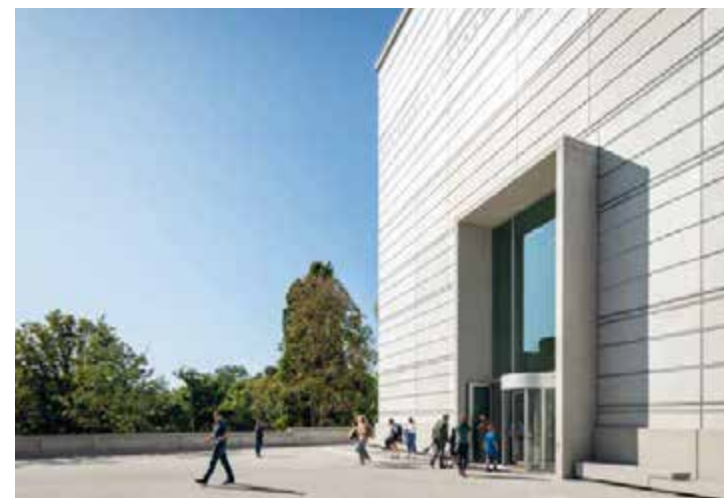
BAUHAUS MUSEUM WEIMAR