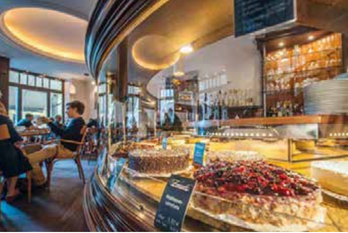
SELECTION OF CAKES AT CAFÉ FRAUENTOR