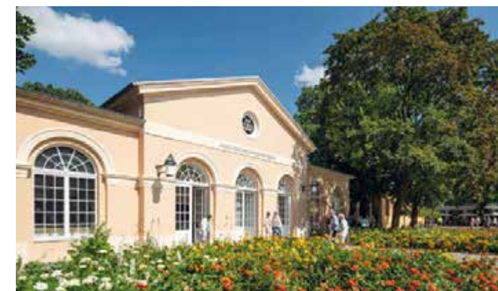
HOUSE OF THE WEIMAR REPUBLIC