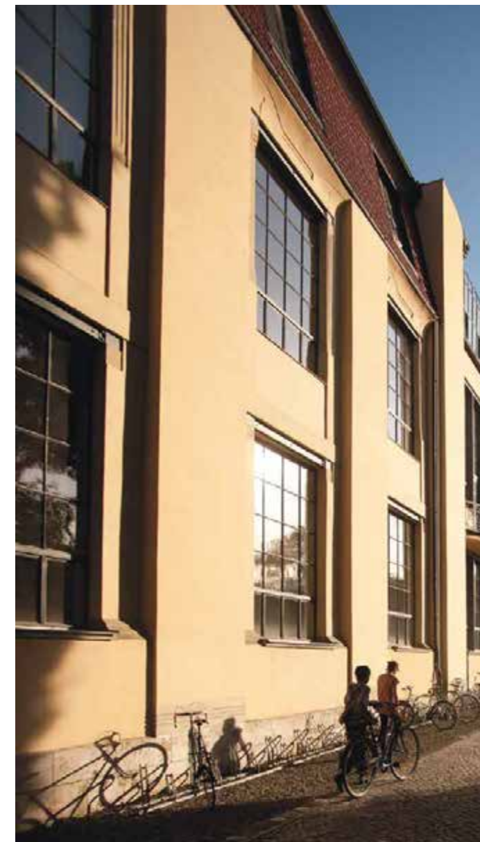
BAUHAUS-UNIVERSITÄT WEIMAR, MAIN BUILDING BY HENRY VAN DE VELDE