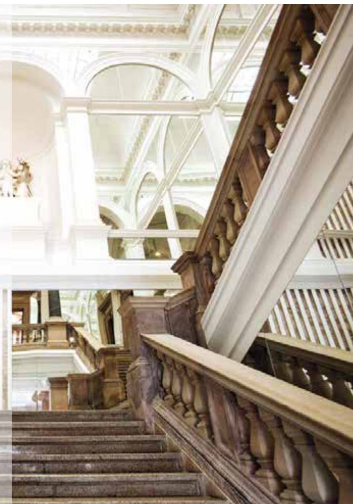
MUSEUM NEUES WEIMAR