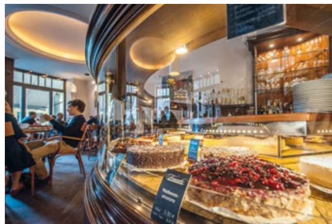
SELECTION OF CAKES AT CAFÉ FRAUENTOR