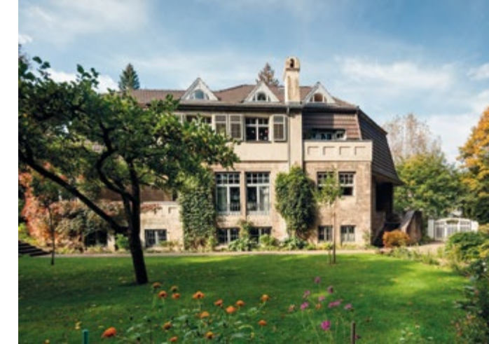
HAUS HOHE PAPPELN