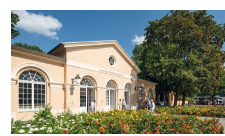
HOUSE OF THE WEIMAR REPUBLIC