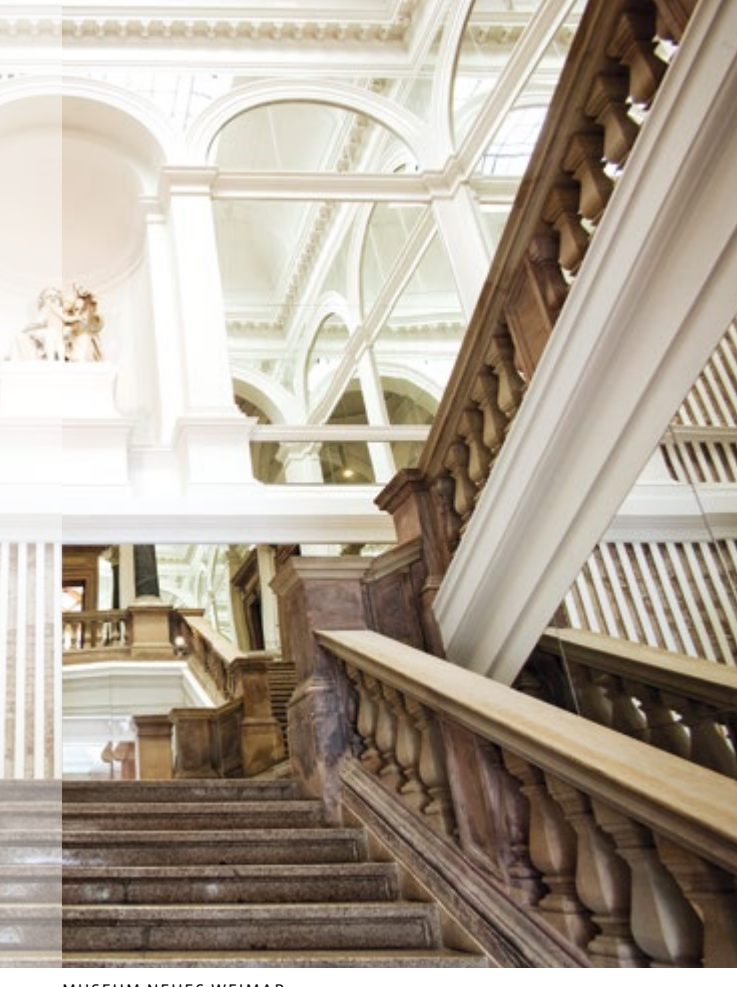
MUSEUM NEUES WEIMAR