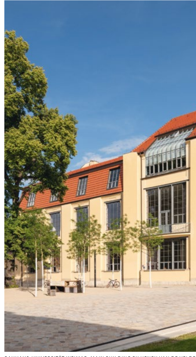
BAUHAUS-UNIVERSITÄT WEIMAR, MAIN BUILDING BY HENRY VAN DE VELDE