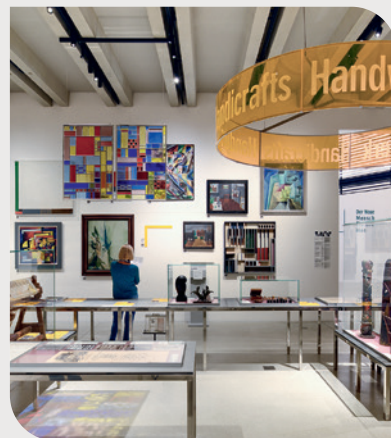
Bauhaus Museum Weimar

● Art in Weimar is an inspiring blend of classical spirit and modern avant-garde. Here, the ideas of Goethe and Schiller converge with the radical creativity of the Bauhaus movement. The Bauhaus Museum Weimar, the Museum Neues Weimar and the Bauhaus Universität Weimar showcase design icons and architectural visions of an entire era. Meanwhile, Classical Weimar, home to the Herzogin Anna Amalia Library, the Weimar City Castle and the residences of poets, invites visitors to take an artistic journey through time. In Weimar, history is not confined to museum walls – it is everywhere and very much alive.