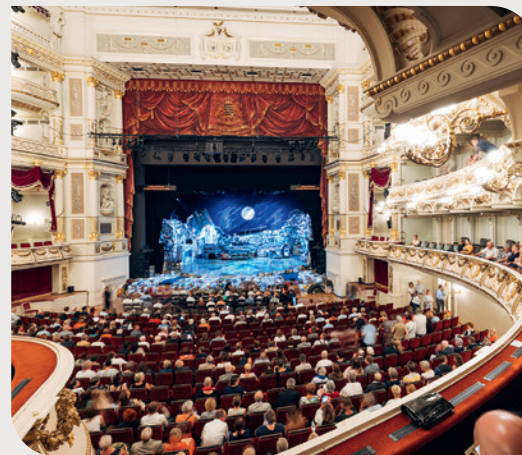
Semper Opera House

● Dresden is a city of grand soundscapes. With the world-famous Semper Opera House, the esteemed Staatskapelle Dresden, and the Frauenkirche – whose first organ was inaugurated by J. S. Bach – the Elbe metropolis is regarded as a beacon of musical excellence. Nearby, the Richard Wagner Sites in Graupa offer a fascinating insight into the life and work of the legendary composer. Well-known festivals, excellent concerts and the beautiful combination of music and architecture make Dresden a place where sound and culture are closely connected.