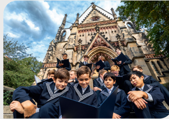
St Thomas Boys' Choir

● Leipzig is the City of Music: Great composers like J. S. Bach and Felix Mendelssohn created some of their most important works here. Today, Leipzig's rich musical legacy lives on through renowned institutions such as the Gewandhausorchester, the Oper Leipzig, and the St Thomas Boys' Choir. Festivals like the Bach Fest and the Leipzig Jazz Days, along with a vibrant contemporary music scene, continue to share this tradition with audiences from around the world.