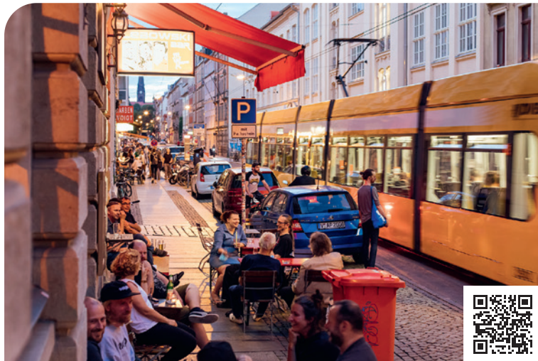
Evening atmosphere in Dresden Neustadt

reflects the city's legacy as the former royal seat of Saxony. Culture lovers from around the world are drawn to Dresden's exceptional offerings: world-class performances at the Semper Opera House and Philharmonic, artistic treasures in the 11 museums of the Staatliche Kunstsammlungen Dresden (Dresden State Art Collections), and the powerful sound of the Staatskapelle Dresden Orchestra. Unforgettable experiences await international events such as the Dresden Music Festival and the Striezelmarkt, one of Europe's oldest Christmas markets. Beyond the city, the Elbland region reveals a landscape of sunlit vineyards, graceful castles, and serene landscape, stretching from the porcelain city of Meissen to the Renaissance beauty of Pirna, at the gateway to Saxon Switzerland. Altogether, Dresden offers a unique harmony of cultural depth and natural beauty, making it an exceptional destination for both enrichment and relaxation.