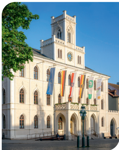
Town hall Weimar

Weimar has been shaped by poets, philosophers, musicians, and designers and is a cultural gem of global significance located in the heart of Germany. Honoured by three listings as UNESCO World Heritage, it is a rich blend of classical heritage, pioneering design and musical brilliance. The legacy of Goethe and Schiller is ever-present in “Classical Weimar”, from