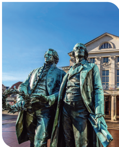
Theatre square with Goethe and Schiller monument

Weimar has been shaped by poets, philosophers, musicians, and designers and is a cultural gem of global significance located in the heart of Germany. Honoured by three listings as UNESCO World Heritage, it is a rich blend of classical heritage, pioneering design and musical brilliance. The legacy of Goethe and Schiller is ever-present in “Classical Weimar”, from