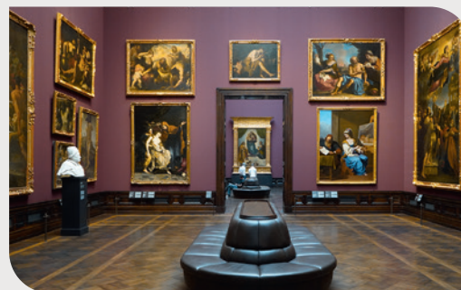
Old Masters Picture Gallery Dresden

● Art in Dresden is as diverse as it is steeped in tradition. The renowned Dresden State Art Collections, with eleven museums – including the iconic Gemäldegalerie Alte Meister (Old Masters Picture Gallery) – rank among the most significant in Europe. While modern and contemporary works are showcased mainly in the Albertinum, the city's creative pulse is kept alive by a vibrant network of independent spaces and studios. The interplay between Baroque splendour and contemporary art creates a visually striking and intellectually stimulating dynamic that is constantly in dialogue with history.