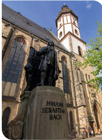
Bach memorial in front of St Thomas' Church

Leipzig fascinates with its unique combination of musical heritage, contemporary art and rich history, while also offering a wealth of natural beauty. Known as the 'City of Music', it attracts music enthusiasts from all over the world, including former figures such as J. S. Bach. Historic sites like St Thomas Church and the city's music museums allow visitors to immerse themselves in this extraordinary heritage. Prestigious events such as the Bach Fest, the Oper Leipzig and the Gewandhausorchester continue this tradition, presenting programmes ranging from the classical canon to modern innovations. Art lovers can experience a remarkable creative transformation at the Spinnerei, which was once the largest cotton mill in Europe and is now a world-renowned centre for contemporary art. Leipzig's numerous museums and galleries, as well as its industrial heritage, give the city a creative and interesting character.