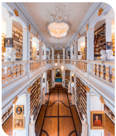
Herzogin Anna Amalia Library