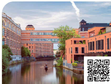
Yarn factory / Weiße Elster

taking a stroll in Clara-Zetkin-Park, having a picnic in Rosental or cycling through the floodplain forest. Ideal settings for swimming, sailing, and a wide range of other water sports can be found at Lake Cospuden and Lake Markkleeberg. Leipzig uniquely combines past and present, culture and nature, making it the perfect destination for those seeking to explore both historic and natural attractions. Visitors will discover exciting contrasts and, above all, an inspiring atmosphere where diversity is embraced.