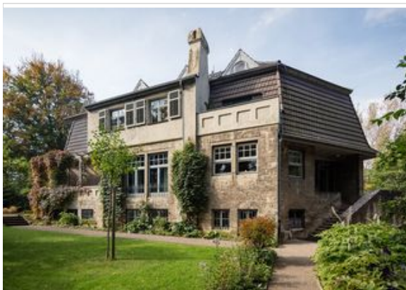
Haus Hohe Pappeln