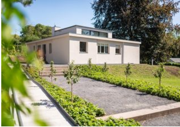
Haus Am Horn