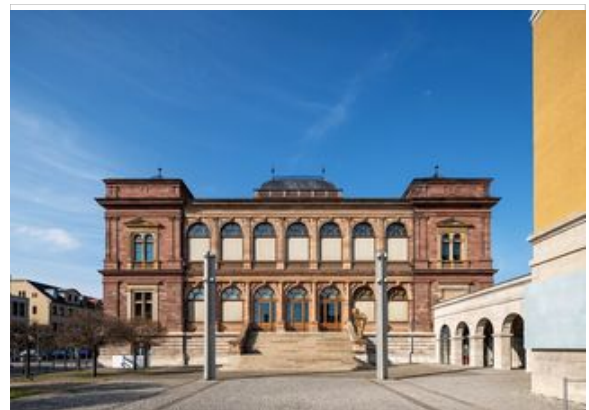
Museum Neues Weimar